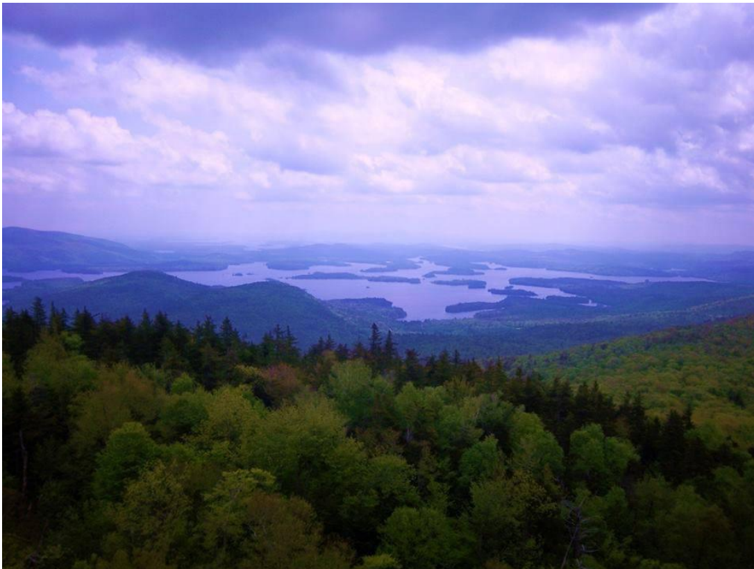
Squam Watershed, New Hampshire View of Squam from Mt. Morgan