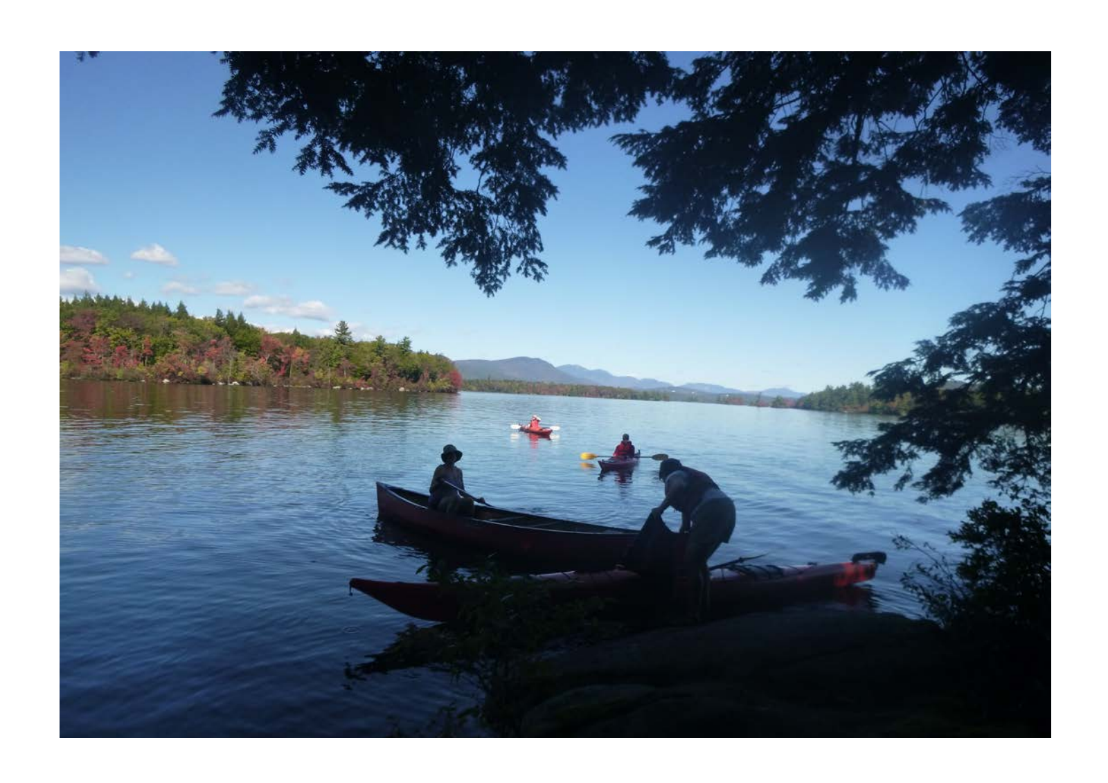
Squam Watershed, New Hampshire

Environmental Leadership Program 2014 Women's Leadership Retreat on Bowman Island